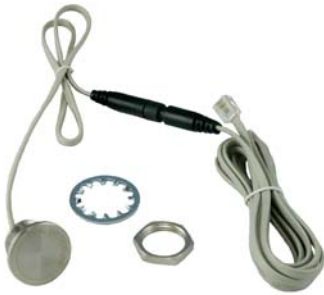
TruTOUCH® Sensors SEN-1501 Series