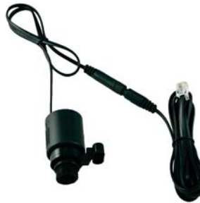
TruFIRE® Solenoids SLD-0914 Series