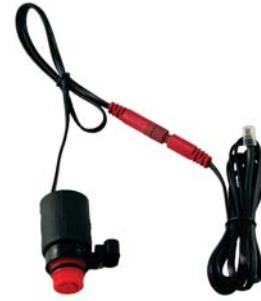
TruFIRE® Solenoids SLD-6214 Series